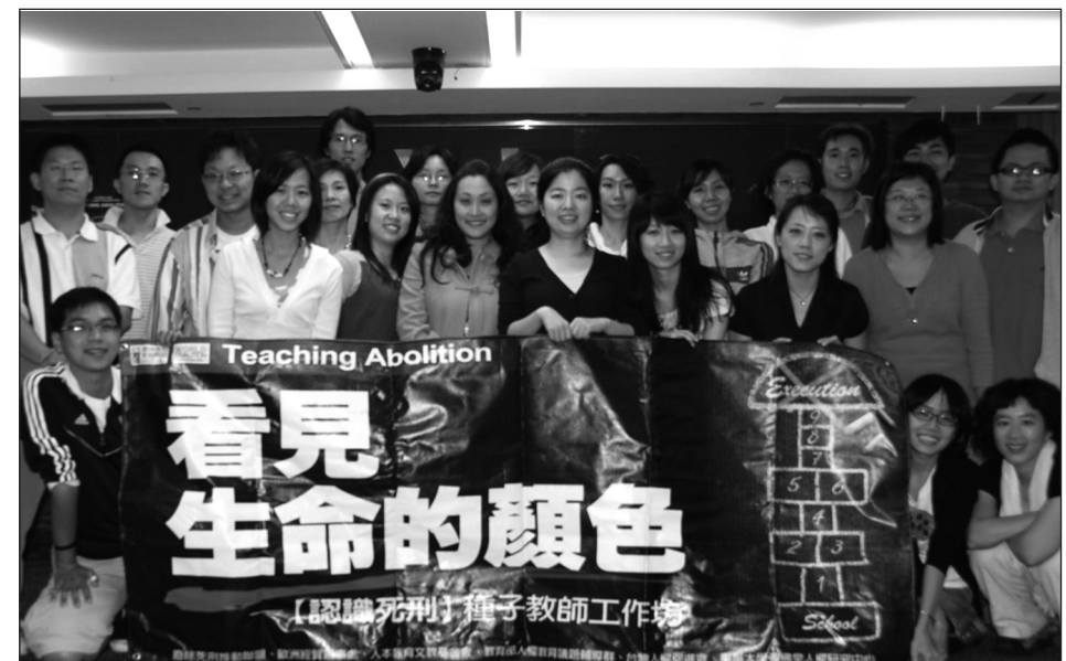
The Taiwan Alliance to End the Death Penalty organised 4 days of workshops on “Teaching abolition” in Taipei.