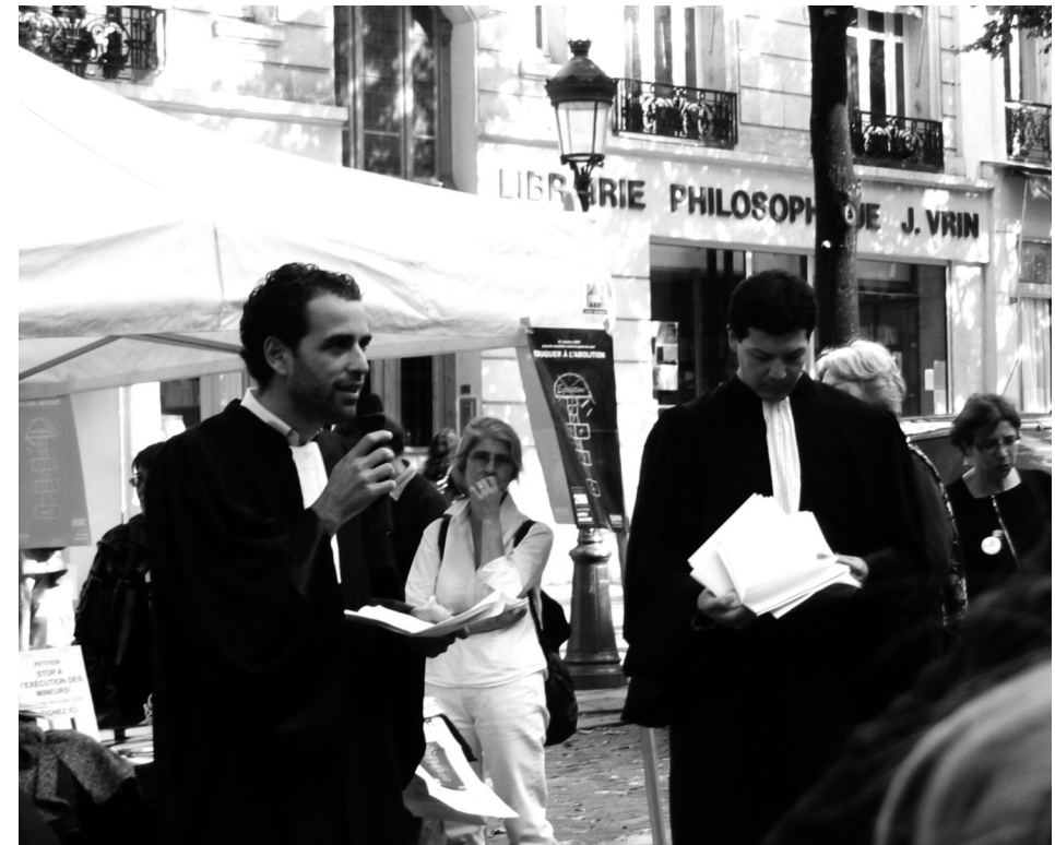
Duel of defences against the death penalty in Paris