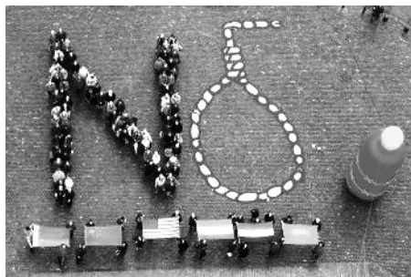
Légende sur la Belgique

By encouraging debates on the death penalty, the members of the World Coalition would like students to understand the state of the world they are living in: the severity, and sometimes cruelty, but also the beauty of the human rights ideal.