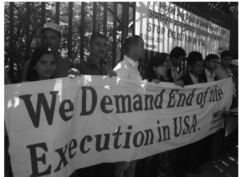
Demonstration against the death penalty in the United States organised in Nepal