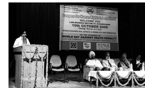
Conference organized by Lawyers for Human Rights in India

The event was covered by the media, particularly after the press conference which was held on 10 October 2009..