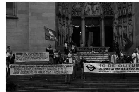
Manifestation contre la peine de mort au Brésil

For this year’s World Day two themes shall be highlighted: the failure of the justice system and the non-dissuasive effect of the death penalty. Even in the safest legal systems innocent people are sentenced to death.