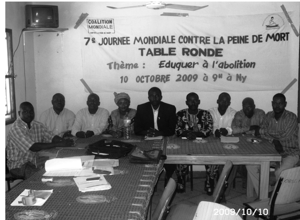
Round table on "educating about abolition" organised in Niger by SYNAFEN