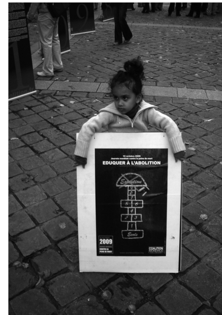
Légende à placer

This Pedagogical Guide will be developed and regularly improved to make it an essential tool to change public opinion particularly in retentionist countries. It could subsequently be divided into sections by world regions.