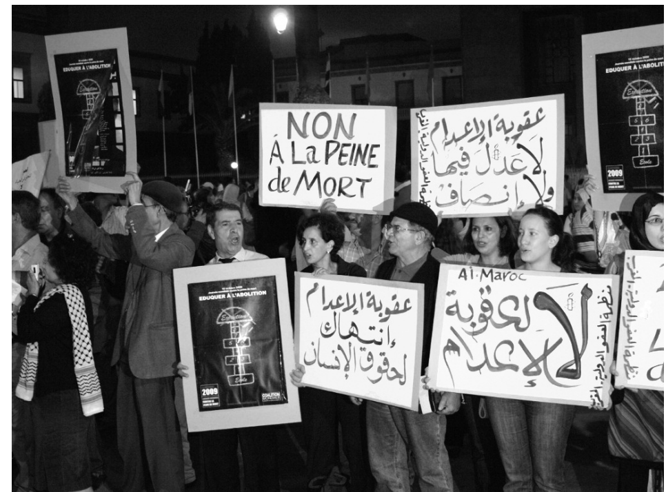
Sit-in in Rabat in front of the Parliament