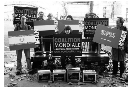
The delegation from the World Coalition before handing in the petitions to the embassies of the four target countries..

In the 20th anniversary year of the Convention on the Rights of the Child and on the 7th World Day Against the Death Penalty, we, the undersigned, call on the authorities in Iran, Saudi Arabia, Sudan and Yemen to thoroughly respect and implement the international commitments they already endorsed and to end all executions of juveniles."