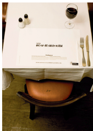
Denmark Living exhibition about the death row inmate last meal

Denounce unfair trials and the lack of transparency, encourage the introduction of moratoria on executions, demand the reduction of the number of capital offences, prepare or join in hundreds of initiatives organised all over the world.