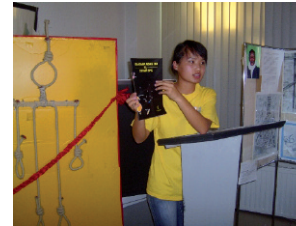
Mongolia Demonstration during the 2007 World Day

with the Islamic diyya custom, those sentenced to death may “compensate” their punishment to the families of their victim by paying them “blood money”. Thus only the richest and most influential Pakistanis escape the death penalty.