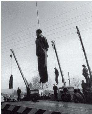
Iran Execution by hanging

In many cases the accused cannot access adequate legal representation, trials are held in secret, or deadlines are so short that there is no time to appeal. In Pakistan, parallel judicial systems and anti-terrorism courts deprive the accused of adequate defence and this results in a considerable number of death sentences being handed down. Appeals for presidential pardons remain limited. In murder cases the law is discriminatory against disadvantaged people, as in accordance