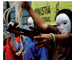
Peru Living exhibition and fake sale of the different means of executions across the world during the 2007 World Day

In India, although there is no official moratorium on executions, the last execution – the only one in ten years – took place in 2004.