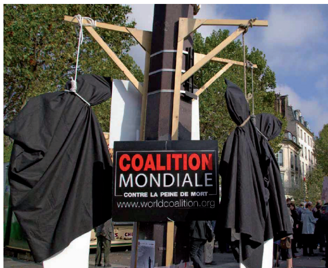
France Organisation of fake hangings during 2007 World Day

Responding to the World Coalition Against the Death Penalty's appeal, every year on 10 October citizens, national and international institutions and NGOs rally together to oppose the use of the death penalty and to recall that its abolition is a universal struggle. Since the creation of the World Day in 2003, hundreds of initiatives including debates, concerts, press conferences, demonstrations, petitions, and educational and cultural activities, have been organised in more than 70 countries across five continents.