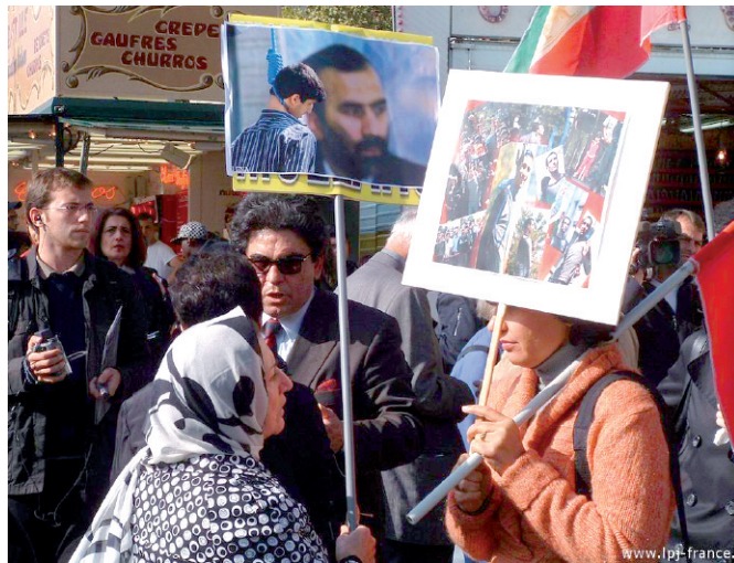
France Demonstration during the 2007 World Day

Some prisoners thus spend decades under sentence of death, waking up every morning with the fear of an imminent execution. The lack of transparency also increases the risks of unfair trials and prevents informed debate on the death penalty in these countries.