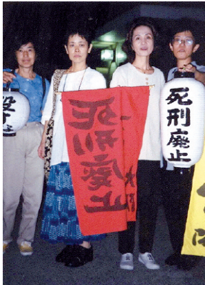
Japan Demonstration in front of the detention centre of Osaka to ask for the liberation of death row inmates

Nevertheless, many Asian countries refuse to reveal information on the use of this punishment. In China, for example, the death penalty is a state secret and no figures on the numbers of death sentences or executions are available.