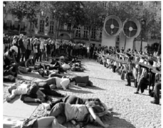
Photo: Flash Mob in Paris, October 10, 2010

A Flash Mob is a group of people who assemble suddenly in a public place, perform an unusual and sometimes seemingly pointless act for a brief time, and then disperse.